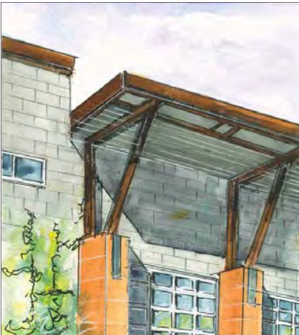
Incorporate green building design strategies into Downtown architecture.

Encourage the extended life cycle of existing building stock through adaptive reuse.