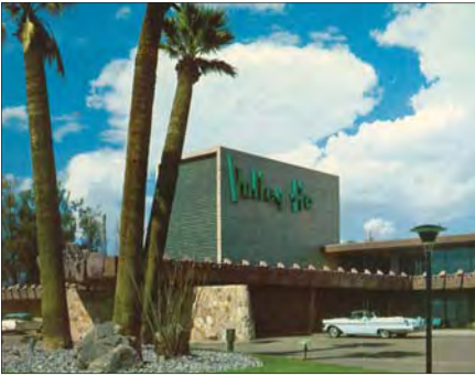
Valley Ho 1956