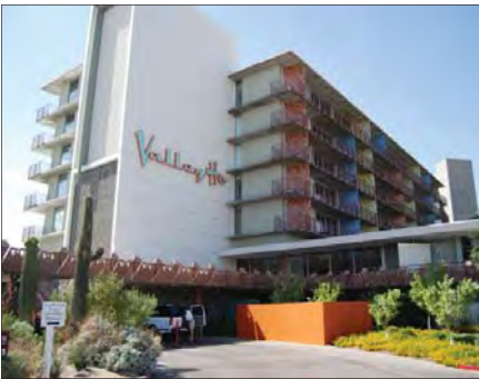
Valley Ho 2009