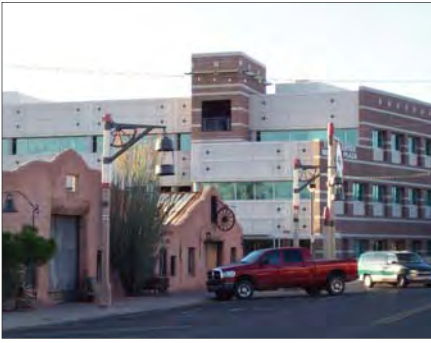
The modern office building (background) sits respectfully next to Cavalliere's Blacksmith Shop (foreground) in Old Town. These buildings illustrate that contemporary and traditional styles can coexist; and that effective sensitive transitions can be achieved through the appropriate use of materials, building massing and other design elements.